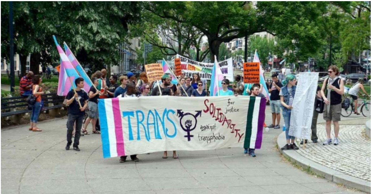
First trans solidarity rally and march, Washington DC, in 2015

How little people know of the realities of life as a transgender. The disinformation campaigns of radical elements within the LGBT movement suggest that transitioning to a different gender is a